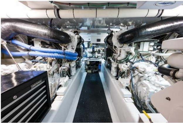
2001 61' Buddy Davis "Klementine" Engine Room