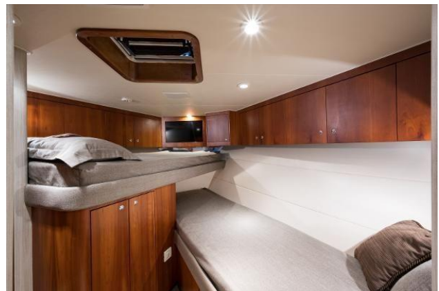
2001 61' Buddy Davis "Klementine" Forward VIP Stateroom