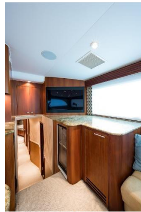
2001 61' Buddy Davis "Klementine" Dinette