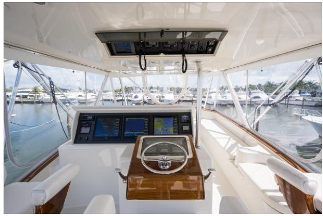
2001 61' Buddy Davis "Klementine" Flybridge Helm