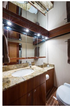
2001 61' Buddy Davis "Klementine" Master Head