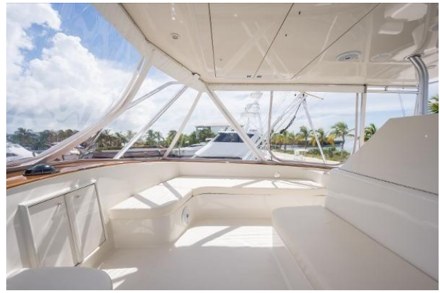
2001 61' Buddy Davis "Klementine" Flybridge Seating & Storage