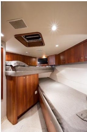
2001 61' Buddy Davis "Klementine" Forward VIP Stateroom