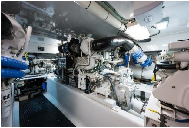
2001 61' Buddy Davis "Klementine" Engine Room