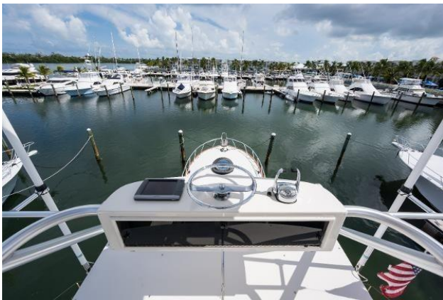
2001 61' Buddy Davis "Klementine" Tower