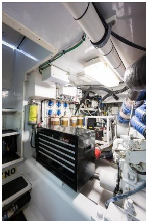
2001 61' Buddy Davis "Klementine" Engine Room