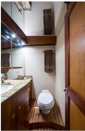
2001 61' Buddy Davis "Klementine" Master Head