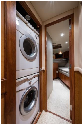
2001 61' Buddy Davis "Klementine" Washer & Dryer