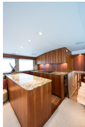
2001 61' Buddy Davis "Klementine" Galley