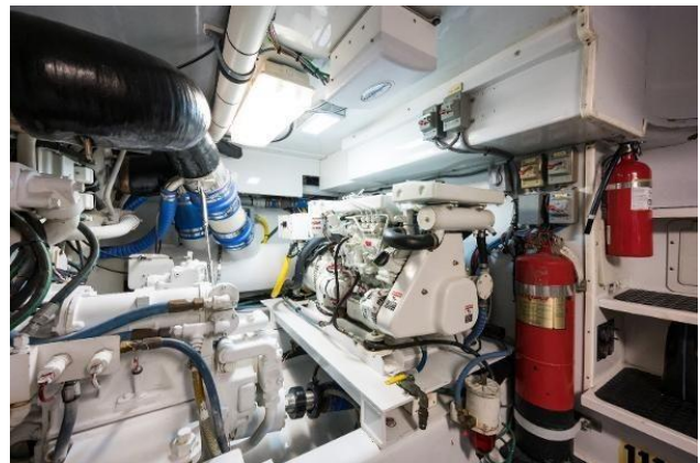
2001 61' Buddy Davis "Klementine" Engine Room