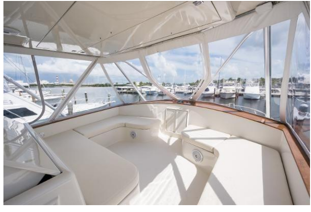
2001 61' Buddy Davis "Klementine" Flybridge Seating & Storage