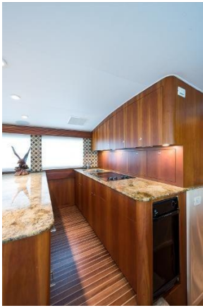
2001 61' Buddy Davis "Klementine" Galley