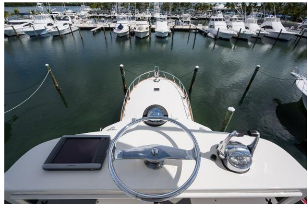
2001 61' Buddy Davis "Klementine" Tower