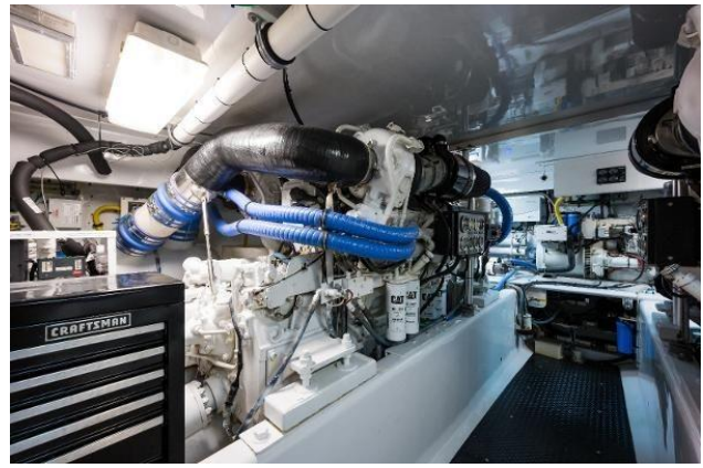
2001 61' Buddy Davis "Klementine" Engine Room