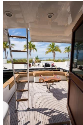
2001 61' Buddy Davis "Klementine" Cockpit