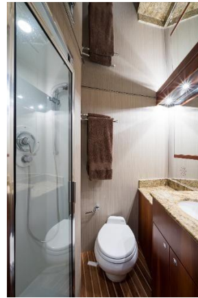
2001 61' Buddy Davis "Klementine" Forward VIP Head