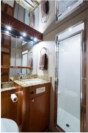
2001 61' Buddy Davis "Klementine" Guest Head