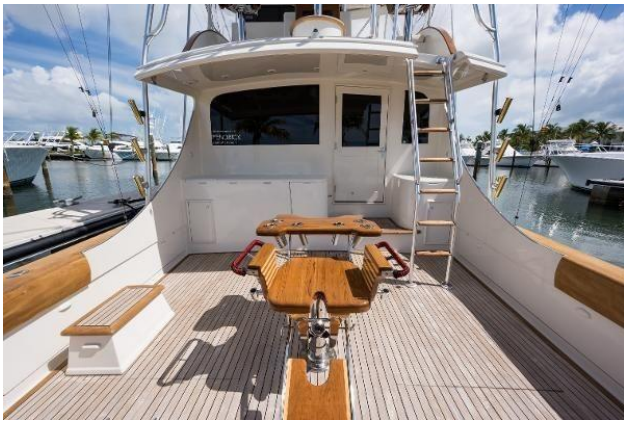
2001 61' Buddy Davis "Klementine" Cockpit