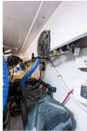
2001 61' Buddy Davis "Klementine" Engine Room