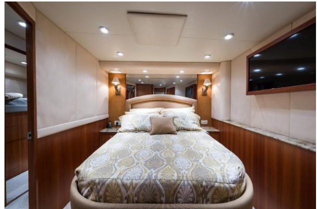
2001 61' Buddy Davis "Klementine" Master Stateroom