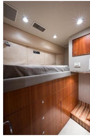
2016 61' Buddy Davis "Klementine" Starboard 4th Guest Stateroom