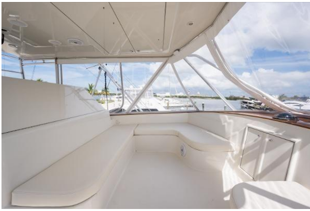
2001 61' Buddy Davis "Klementine" Flybridge Seating & Storage