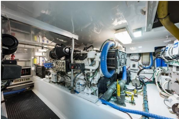
2001 61' Buddy Davis "Klementine" Engine Room