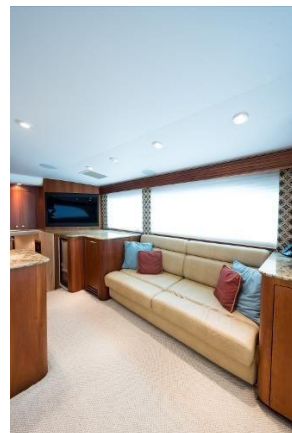
2001 61' Buddy Davis "Klementine" Salon