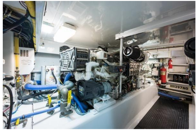
2001 61' Buddy Davis "Klementine" Engine Room