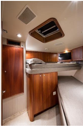
2001 61' Buddy Davis "Klementine" Forward VIP Stateroom