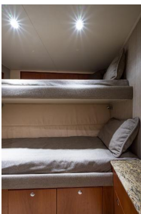
2001 61' Buddy Davis "Klementine" Starboard Guest Stateroom