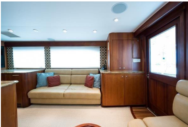
2001 61' Buddy Davis "Klementine" Salon