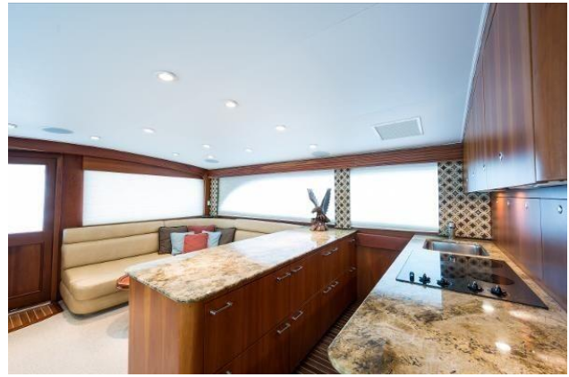
2001 61' Buddy Davis "Klementine" Galley