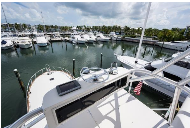
2001 61' Buddy Davis "Klementine" Tower