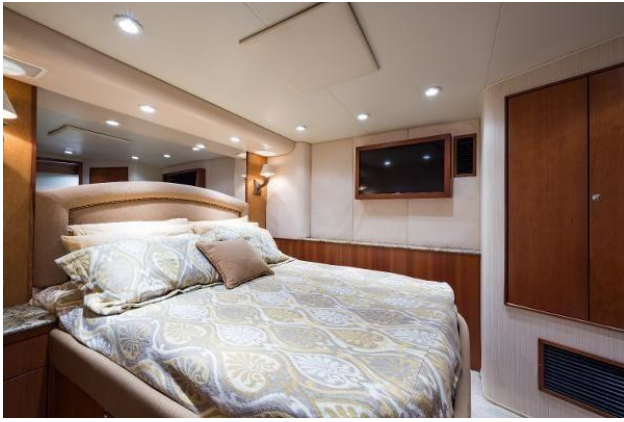
2001 61' Buddy Davis "Klementine" Master Stateroom