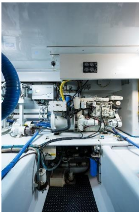
2001 61' Buddy Davis "Klementine" Engine Room