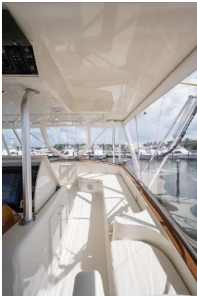
2001 61' Buddy Davis "Klementine" Flybridge