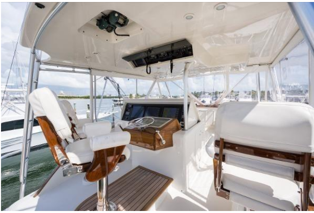
2001 61' Buddy Davis "Klementine" Flybridge Helm