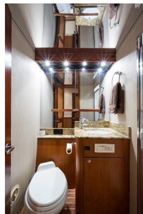
2001 61' Buddy Davis "Klementine" Guest Head