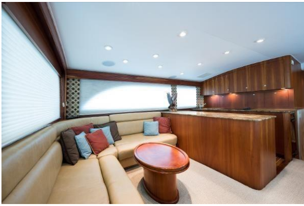
2001 61' Buddy Davis "Klementine" Salon