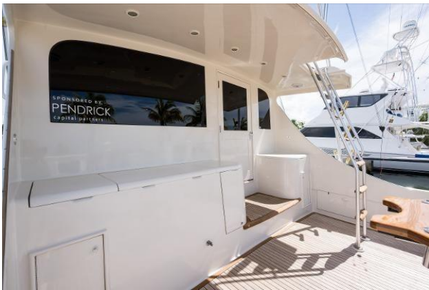
2001 61' Buddy Davis "Klementine" Cockpit