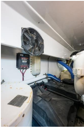
2001 61' Buddy Davis "Klementine" Engine Room