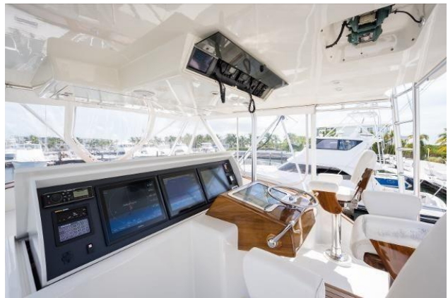
2001 61' Buddy Davis "Klementine" Flybridge Helm