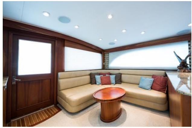
2001 61' Buddy Davis "Klementine" Salon