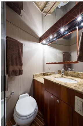
2001 61' Buddy Davis "Klementine" Forward VIP Head