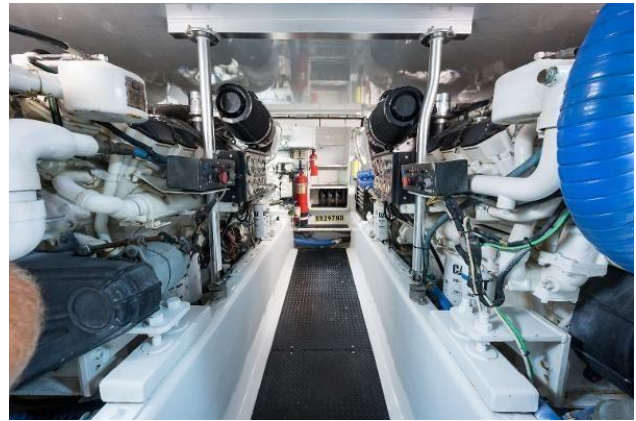
2001 61' Buddy Davis "Klementine" Engine Room