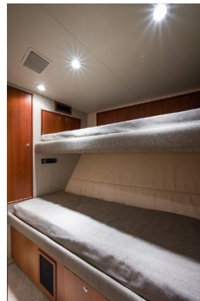
2001 61' Buddy Davis "Klementine" Starboard Guest Stateroom