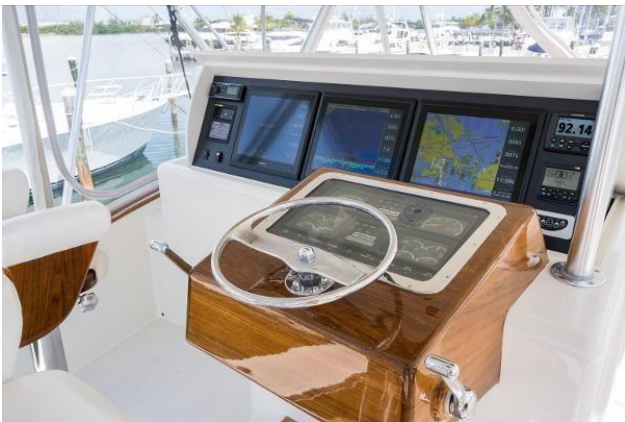
2001 61' Buddy Davis "Klementine" Flybridge Helm