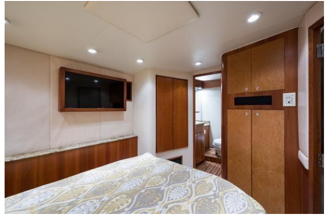
2001 61' Buddy Davis "Klementine" Master Stateroom