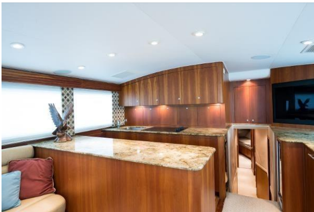
2001 61' Buddy Davis "Clementine" Galley