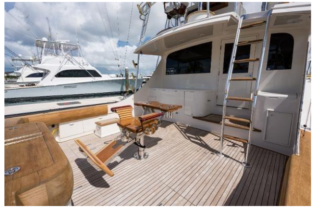
2001 61' Buddy Davis "Klementine" Cockpit