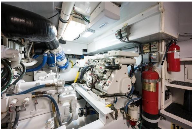
2001 61' Buddy Davis "Klementine" Engine Room