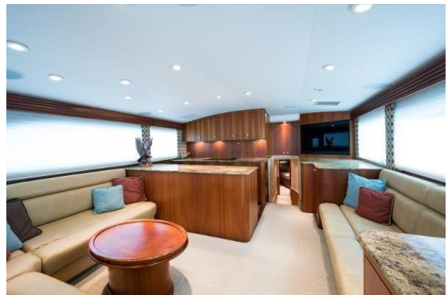
2001 61' Buddy Davis "Klementine" Salon