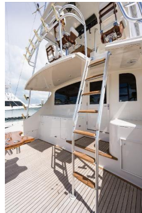
2001 61' Buddy Davis "Klementine" Cockpit